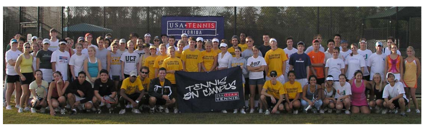
Participants at the fall 2005 Daytona Cup from the University of Central Florida, Georgia Tech, University of South Florida, University of Miami and Flagler College.