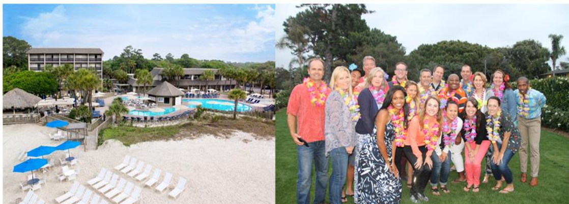
Think you can top our TOC Coordinators' Hawaiian style?